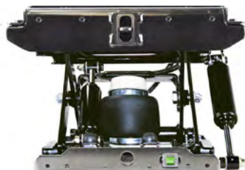
Double Damper View