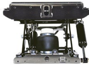
Double Damper View