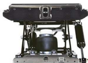
Double Damper View