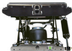
Double Damper View