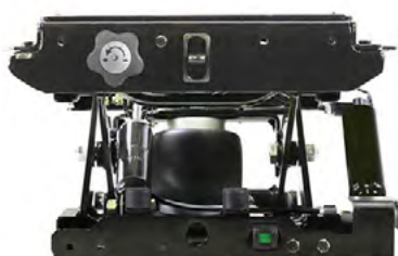
Double Damper View